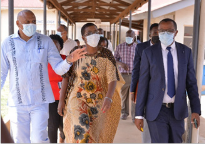
Tour in the hospital